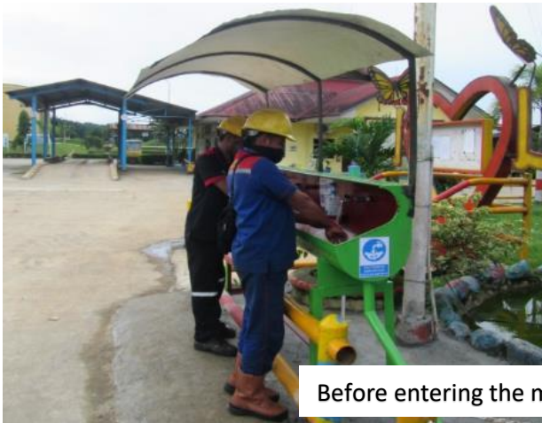
Before entering the mill/estate, you must wash your hands.

Hand washing facilities with water faucets that may be opened and closed without contact (e.g. using a foot pedal) are provided in numerous areas, such as at the entrance, at the scales, in warehouses, entrances to offices, and workshops. Security and unit leaders ensure that all workers and their families wear masks starting from home, during work, returning home, outside the home, while in public places/facilities.