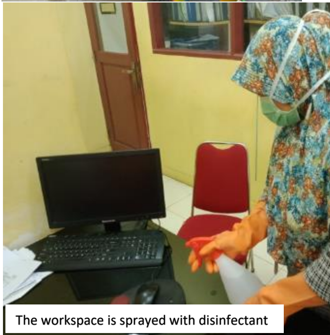
The workspace is sprayed with disinfectant